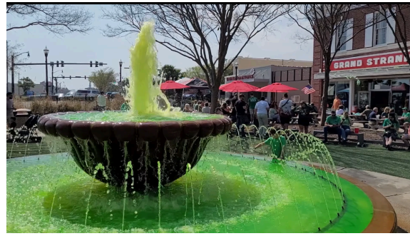
Everyone who traveled by Nance Plaza was seeing green for MBDA sponsored St. Patrick's Day festivities in the park.