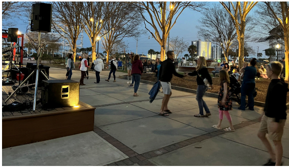
Nights at Nance kickoff concert with The Formers on March 14.